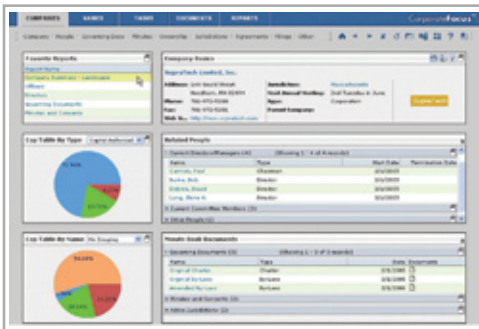
GENERATE FULLY DILUTED CAP TABLES

Stock plan administration best practices require that all supporting documents be carefully tracked along with the related stock option records. If an issue arises, it's easy to be able to look back at the original signed documents or determine who made a change. Equity Focus is the only system that dynamically links corporate governance documents to stock plan records to insure that all your information is supported by appropriate and auditable documentation.